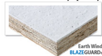
Figure 3: Blazeguard's cementitious coating offers a Class A flame spread rating, 20-minute thermal barrier and meets all relevant fire codes.

"With SIPs, we have been able to set up to 10,000 square feet per day," Becker says. "They give you a lot of already-insulated roof very quickly."