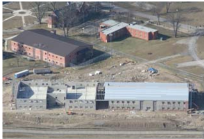
Figure 4: The 40,000 square foot Marysville prison dorm roof is 432 feet long.

“If we can save you 2-3 weeks onsite, you don’t have to have job-site trailers there, don’t have to insure your crews, and can move on to the next job,” he notes. “Contractors can also get ahead of their schedules, which makes everyone happy.”