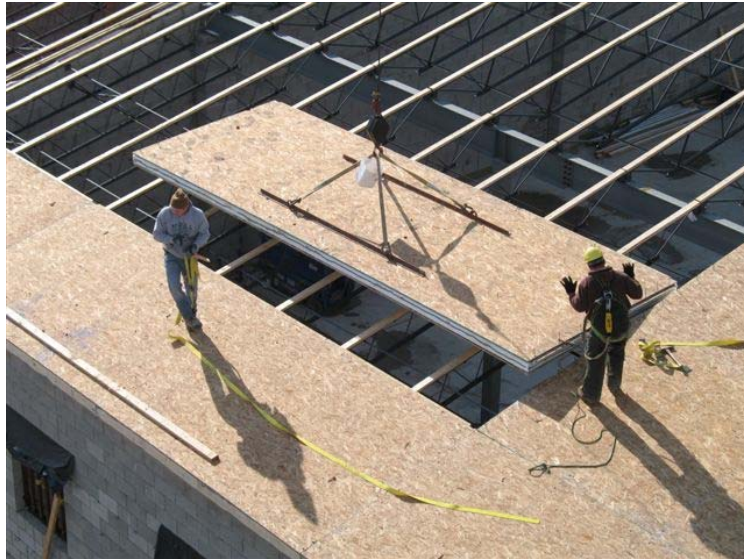
Figure 1: Workers place an 8' x 24' jumbo SIPs panel in Marysville, Ohio.

Since SIPs are designed and constructed in the factory and shipped pre-assembled to job sites, contractors and builders are spared the time and expense of estimating and ordering materials as well as the time and expense of constructing traditional 2' x 4' stud walls or roofs and blowing or placing insulation.