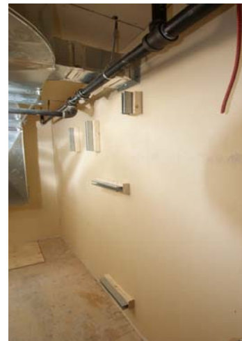
Fully painted FR Deck Panels walls and ceilings provide a clean, safe interior face for control rooms holding electrical, heating and plumbing equipment.