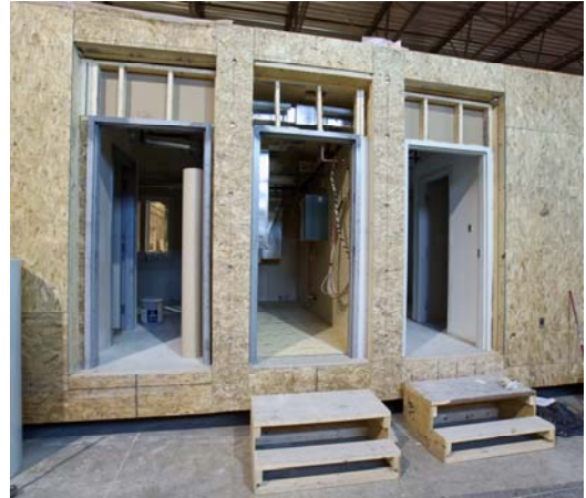
FR Deck Panel (white interior face) lines the inside walls of these mechanical control rooms.

The Mule-Hide FR Deck Panel provides the easiest to install and most economical fire-rated panel for commercial modular construction on the market today.